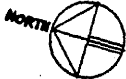
OVERALL SITE PLAN. TMK 7-6-21:7 1" = 100'