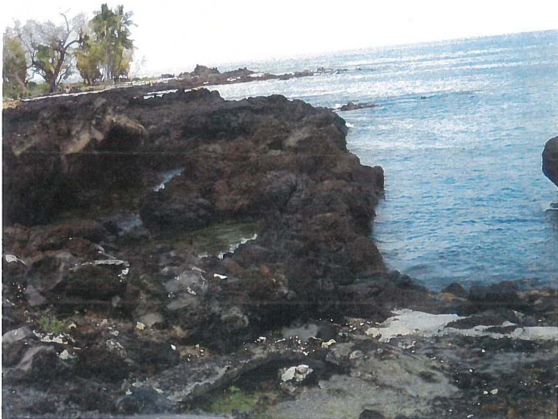
Nearby Road/Parcel 10 illustrates no sand or rubble from littoral processes