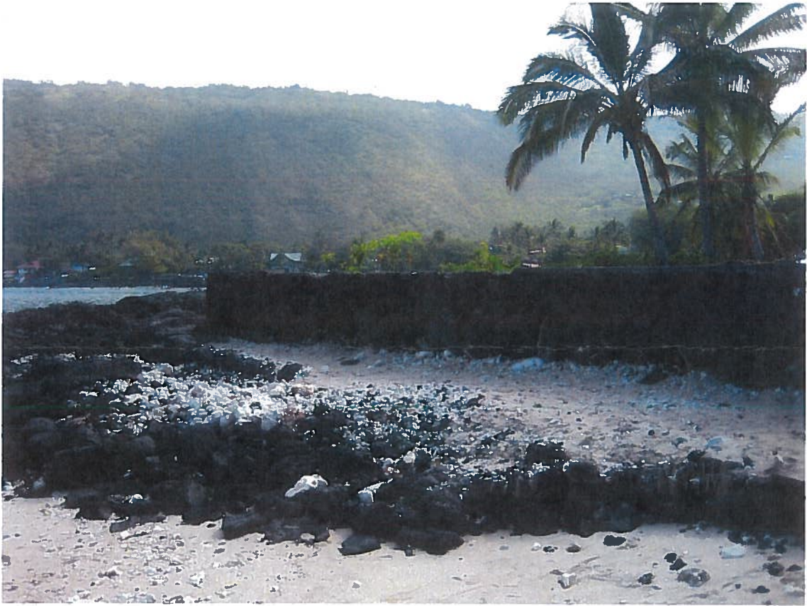
Parcel 27 illustrates sand and carbonate rubble on shoreline