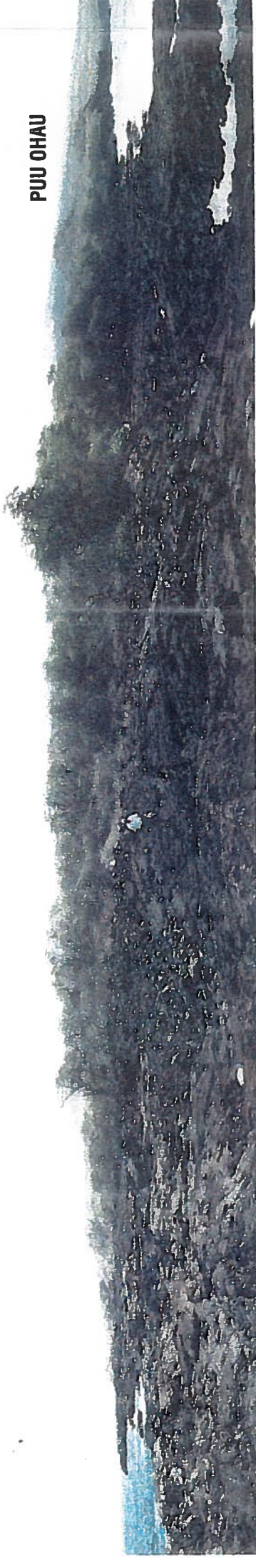
3. Typical rocky shoreline edge conditions looking south towards Puu Ohau and north.