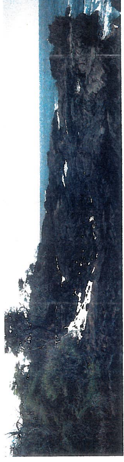
4. Coastal view looking south. Existing shoreline trees include Kiawe, Hale Koa and Noni.