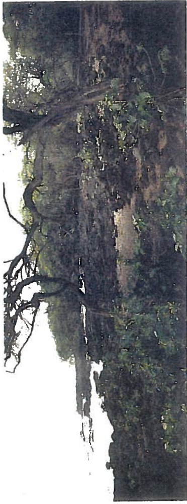
1. Typical rocky coastline condition. Coastal view looking north towards Coconut Beach.