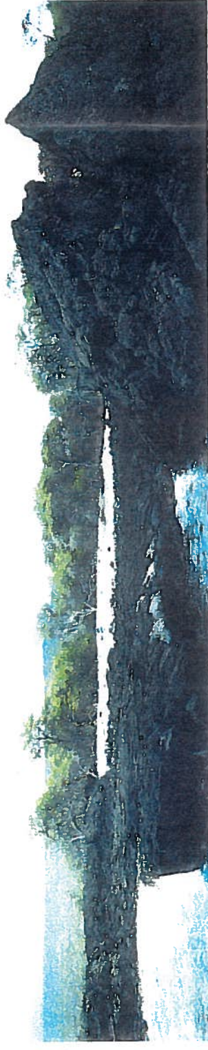
2. Shoreline view looking mauka at Kekiwaha Beach, near Hokuwano Village.